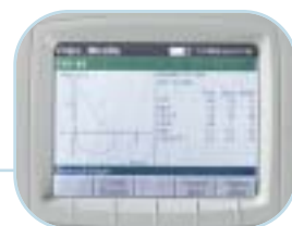
Large Color Display Display real-time curves as Flow/Volume, Volume/Time, or Pre and Post on this easy-to-read color LCD display. All efforts are contrasted against a predictive curve for better coaching and easy comparison.