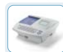
Welch Allyn CP 100™ Transfer information via SD card

Transfer test data and patient information to individual patient records in your EMR for analysis and permanent storage