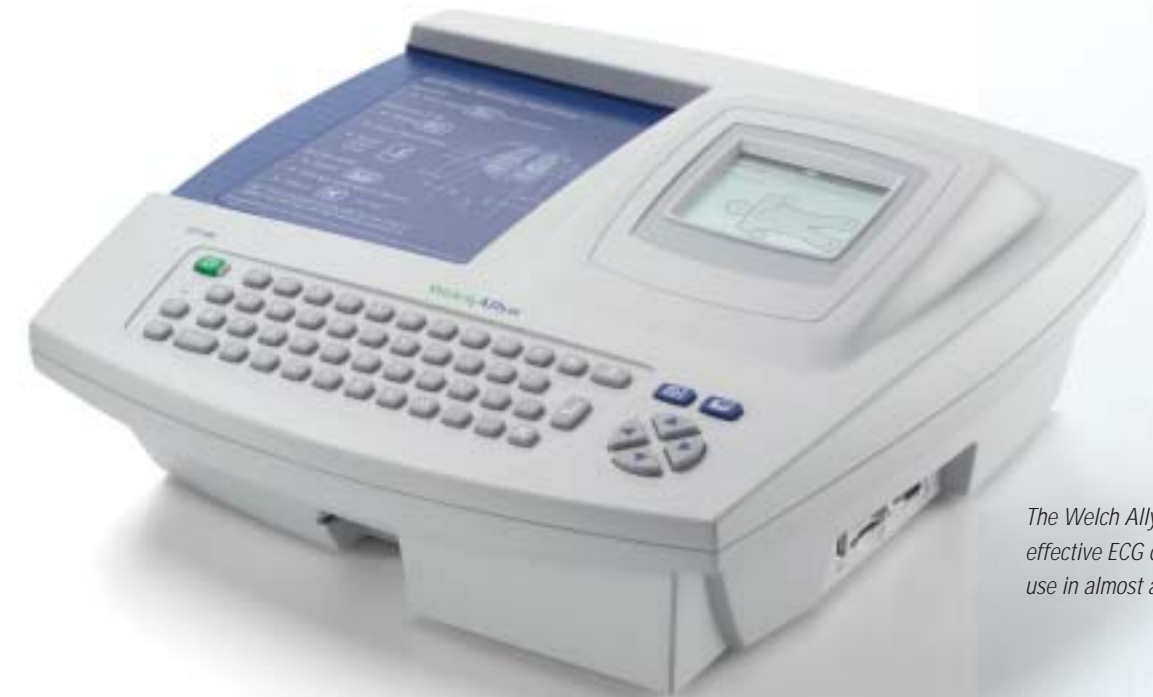
The Welch Allyn CP 100 is a cost-effective ECG device designed for use in almost any office setting

Introducing a new family of multichannel electrocardiographs that are flexible enough to work in any setting. These reliable, easy-to-use devices were designed using proprietary Welch Allyn technology to make taking ECGs a snap. With an intuitive design and advanced software features, these EMR-ready devices can help make your practice more efficient by allowing you to quickly administer patient tests and manage patient information.