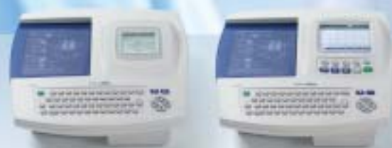
Welch Allyn CP 100™