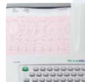
Customizable Report Formats Prints the chart-sized reports you want in the format that works best for you and your staff