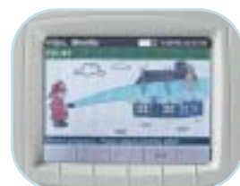
Pediatric Incentive Screen Coach, motivate and make testing more fun. Because children understand how to help the fireman blow out the fire, the incentive screen helps children understand your goals and take the test more easily.