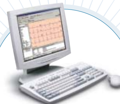
Welch Allyn CardioPerfect™ Workstation Software