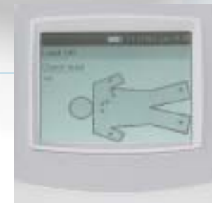
Lead Quality Graphic Saves valuable time and ensures accurate data capture by highlighting poor connections