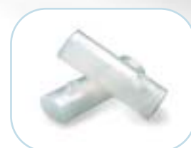
Disposable Flow Transducers Designed for use by an adult or child, the breakaway feature minimizes risk of cross contamination. No sterilization, no cleanup—just safety and savings.