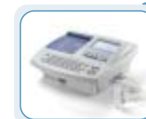
Welch Allyn CP 200™ Transfer information via direct connection or SD card